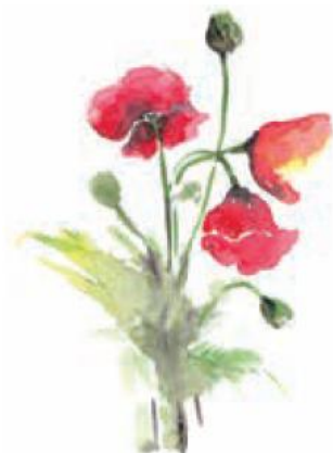
Water colour on paper.