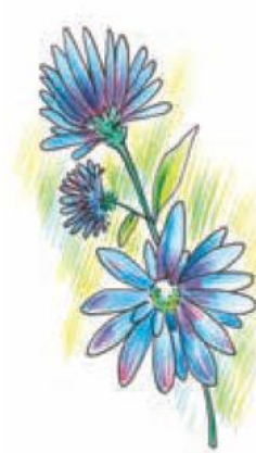
Colour pencil shading on paper.